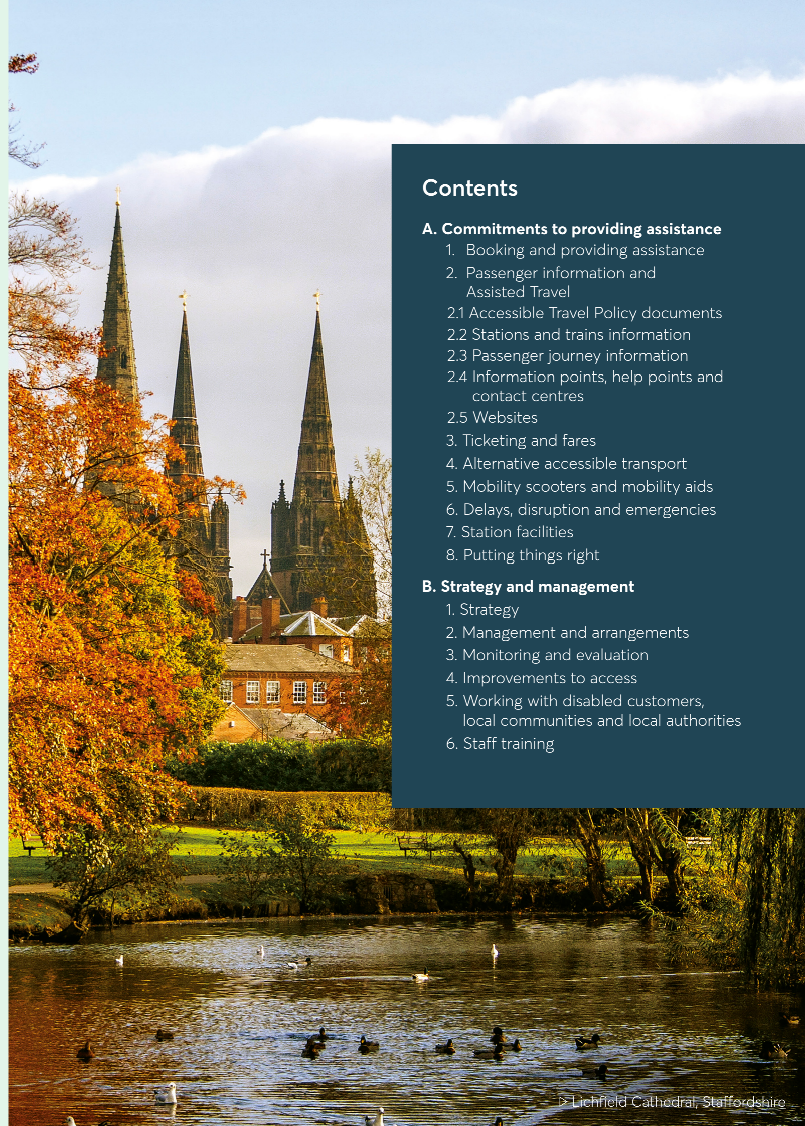
▷ Lichfield Cathedral, Staffordshire